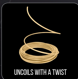
UNCOILS WITH A TWIST