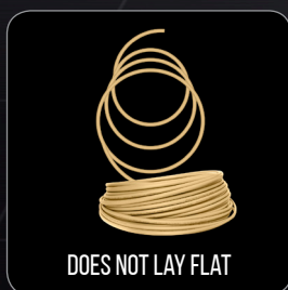
DOES NOT LAY FLAT